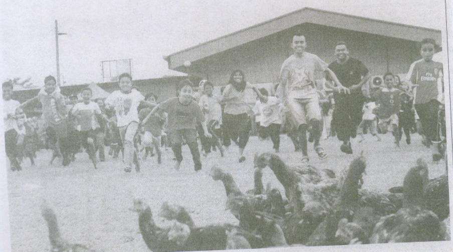
Wild run: Children attempting to catch the chickens in the telematch.