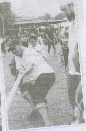
Strong pull: Villagers competing at the Tug-of-War.